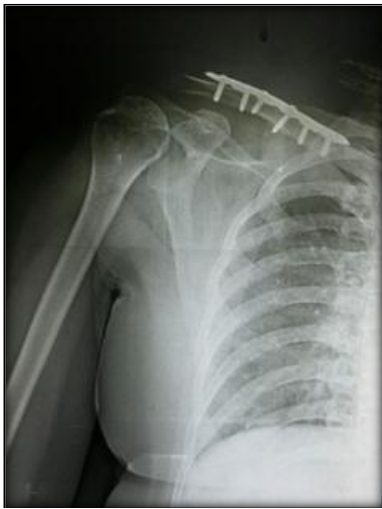
6 weeks follow up x-ray