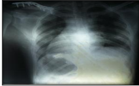
Immediate post operative x-ray