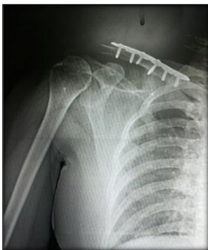
11 weeks x rays showing union